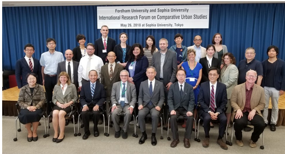
Fordham participants and Sophia University faculty and administrators