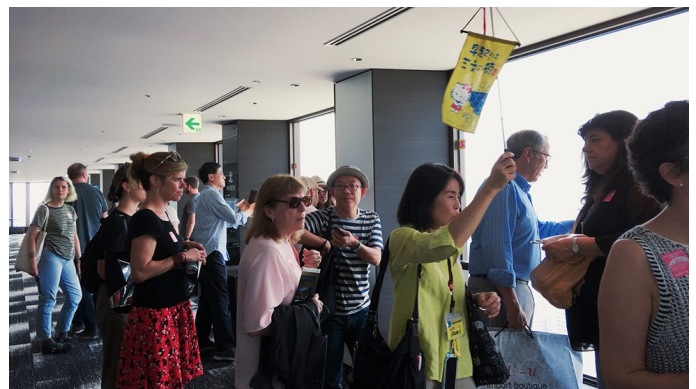
Fordham participants enjoy a boat ride on the Sumida River, Tokyo