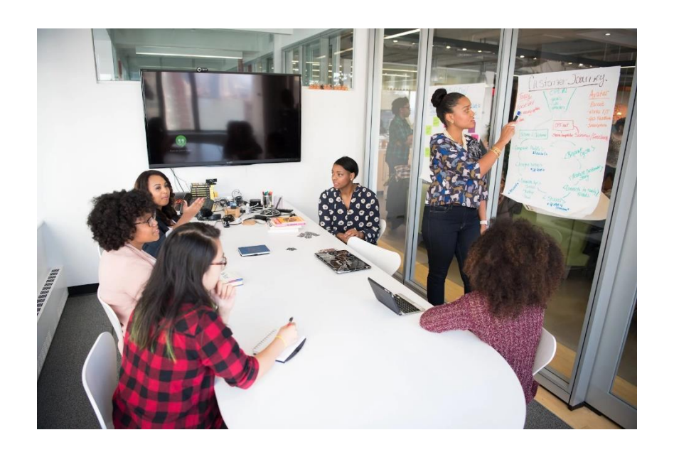
Academic and Career Support

Academic and Career Support organizations are essential to have within a community. The goal is to assist people seek employment information and find out about career development training opportunities. Since different factors may affect a person's success in their academic or career path, these organizations assist youth in different ways to help them reach their goals. This includes working closely with each individual to provide access to the proper services and direct them to full-time employment. Areas of focus should include: