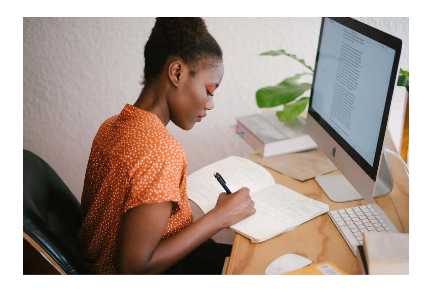
Job Search and Employment Assistance

Employment assistance programs are very beneficial, especially for youth. The job search process can be very overwhelming to tackle alone, as there are numerous paths to choose from and there are many factors that go into the employee selection process. This program can assist individuals look into different employment options to find the right career for them. Counselors are available and provide referrals and resources for individuals as well as families. Employment organizations prepare youth in foster care for job interviews by teaching professionalism and helping them explore employment options.