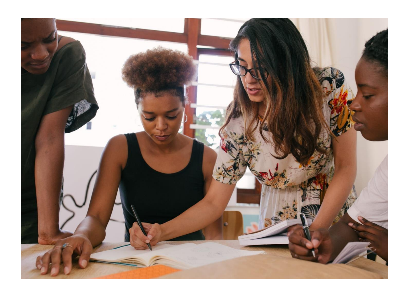
Juvenile Justice Systems

Many programs are designed specifically to cater to the needs of youth within the justice system. Departments seeks to create a more fair and effective justice system. Within these programs, the youth take part in community-based prevention projects that promote individual change. Additionally, alternative schooling may be offered to the youth to see if they perform better in a new environment that uses a different curriculum. These methods are done to help youth follow a more positive path.