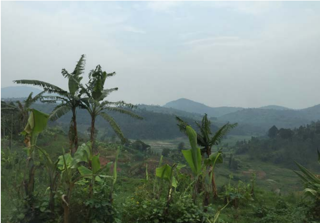
A DISTANT VIEW OF THE DIRT ROADS TO GET TO KIBEHO, A SMALL TOWN IN SOUTH RWANDA