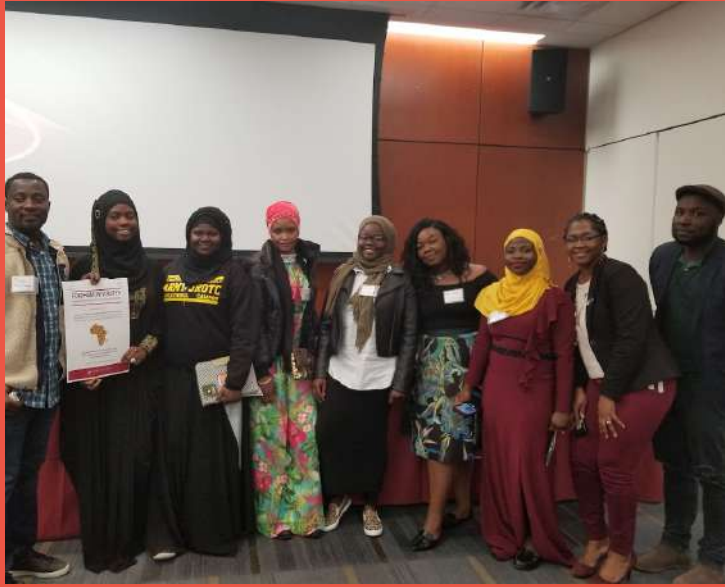
Young African Immigrant Voices, March 2018