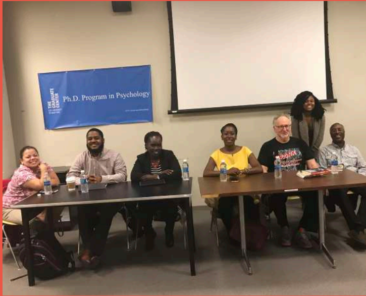
CUNY Graduate Center - Brown Bag Lunch, November 2017