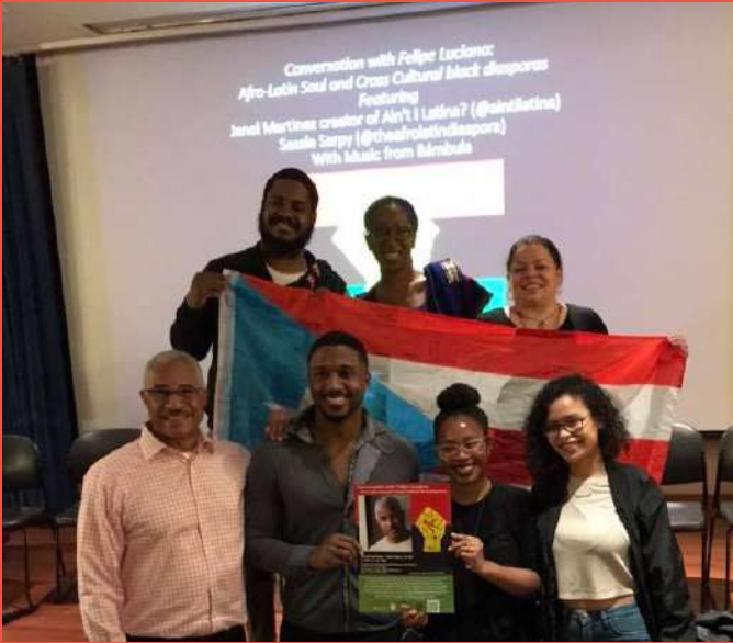
Afro-Latinx Forum, February 2018