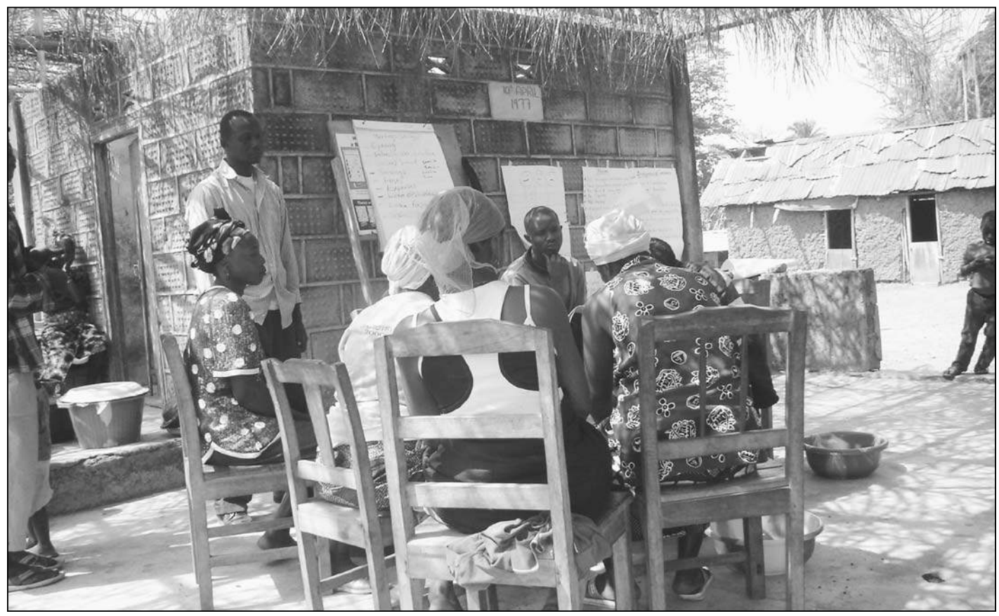
A CRS training of field agents in Sierra Leone

any friends have asked me, where is Sierra Leone? Located in West Africa, surrounded by the Atlantic Ocean, Guinea and Liberia, Sierra Leone is roughly the size of Ireland. After gaining independence from Britain in 1961, political instability quickly followed and culminated in the 1991 civil war, which lasted for 11 years. Sierra Leone currently ranks at the bottom (177th out of 177) of the UNDP Human Development Index.