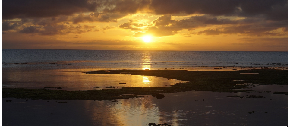
Guam is a Pacific Small Island Developing State (PSIDS) that has been and will continue to be affected by climate change (Image courtesy of Pixabay).

PSIDS have advocated for a rights-based approach at international conventions but remain skeptical of outside policies that could infringe on their governments' sovereignty or their citizens' rights. Rights-based