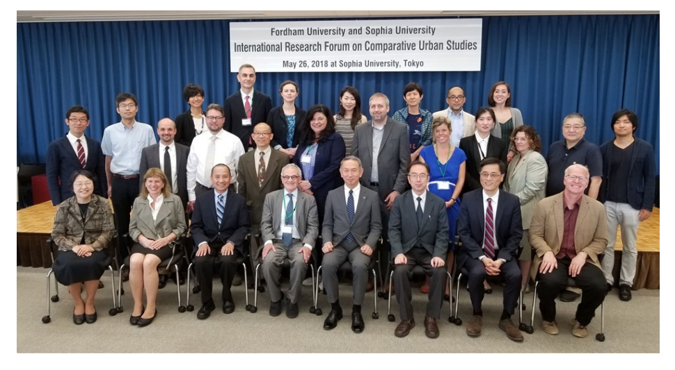
Fordham participants and Sophia University faculty and administrators