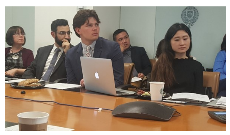
Faculty fellows and student interns listening to presenter