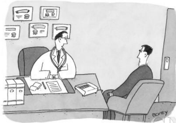
"There's no easy way I can tell you this, so I'm sending you to someone who can."